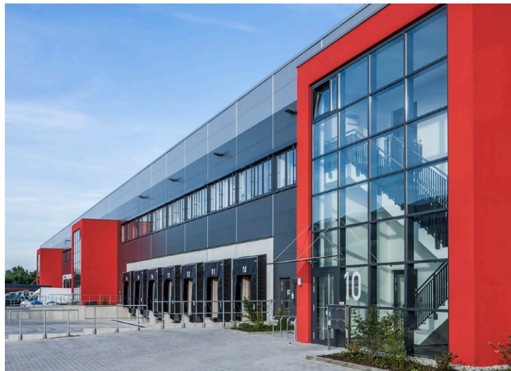
BTG Branch Office Olching

As of 1st February 2016 BTG Internationale Spedition GmbH's branch office in Olching began working with a new partner in Poland.